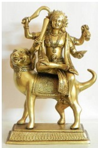
Bhairava as Dandapani

Bhairava Ashtami, also called Kaalaashtami, Kaala Bhairava Ashtami, Kaala Bhairava Jayanti, Bhairavashtami and Bhairava Jayanti, is a sacred day, commemorating the birth of Lord Bhairava. This event falls on the eight lunar day in the Krishna Paksha (fortnight of the waning moon) of the Hindu month of Kartik (November-December).