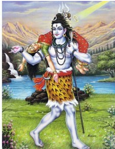
Shiva with Sati's Corpse on His Shoulders

When Sati reached the site of the yagna, Daksha refused to even acknowledge her and insulted her and Shiva. Unable to bear her father's insulting words against her husband, she committed suicide by jumping into the sacrificial fire. When Shiva came to know about this, he was furious. He, along with his ganas, went to the site of the yagna and completely destroyed it. He then cut off the head of the arrogant Daksha.