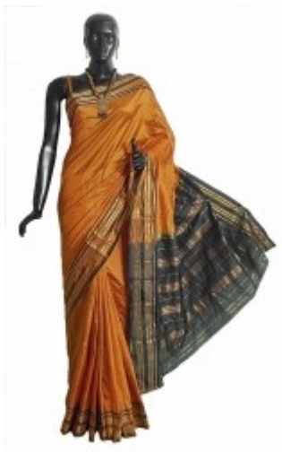
Buy this Saree

CHECKERED CHROME YELLOW NARAYANPET SILK SAREE FROM ANDHRA PRADESH