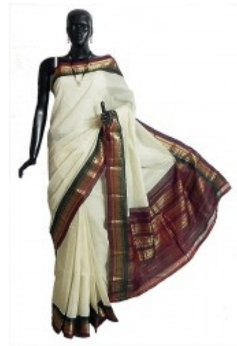
Buy this Saree

The Gadwal style of weaving uses a combination of silk and cotton, which makes these sarees ideal to wear for a wide variety of occasions, ranging from small home functions, to religious occasions, party wear, weddings and so on.