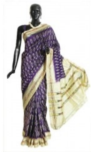
Buy this Saree

The fabric used here is a wonderful mix of cotton and silk. Natural dyes and colors are used to further beautify the saree. Pochampally is yet another essential in the wardrobe of any true saree lover.