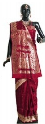
Buy this Saree