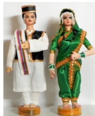
Buy this Doll Set