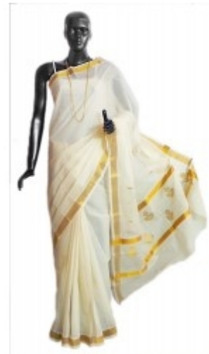
Buy this Saree

Non-kasavu mundu sets have different colored borders and the wearer may match her blouse with that border color. In the case of a kasavu set too, the wearer can choose between a blouse of the same color or a different contrast color, with or without ornate work on it.