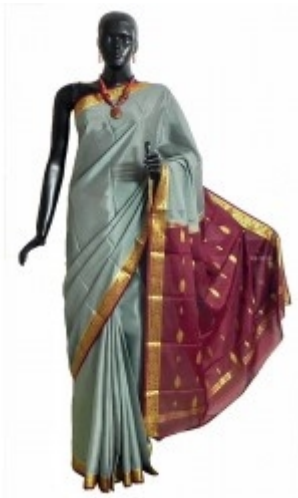
Buy this Saree

GREY MYSORE CREPE SILK SAREE WITH MAROON BORDER AND PALLU WITH ZARI