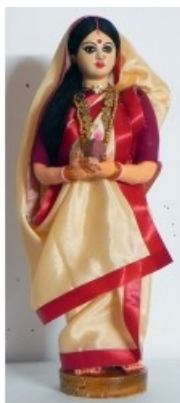
Buy this Doll