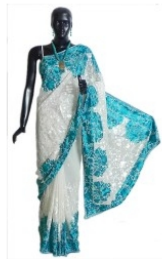
Buy this Saree

The latest craze among fashionistas of this generation is the net or the jaali saree, which is embellished with rich sequins and borders. The other new trend is to drape a half-saree-type garment over slacks or tights, as the famous Bollywood actress, Sonam Kapoor had worn at an event a few months ago.